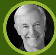
Bill Keane Photographer